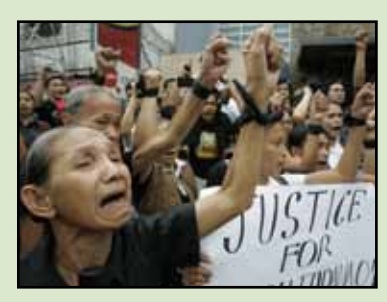
Sympathizers grieve as they clench their fists during the arrival of one of 30 massacred journalists at UNTV media headquarters in suburban Quezon city, Philippines, Dec. 2009.

On the morning of 23 November 2009, at about 9:00 am, a convoy of seven vehicles 107 left the town of Buluan in Maguindanao, a province in the southern Philippine island of Mindanao. The convoy was bound for Maguindanao's capital, Shariff Aguak, to file a certificate of candidacy for governor of the province in the May 2010 election. The convoy included 37 journalists, invited to cover the event.