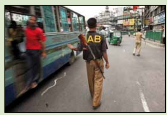
A Bangladesh special forces 'Rapid Action Battalion' soldier guards a street in Dhaka, Bangladesh, Nov. 9, 2005.

On the morning of Sunday 12 December 2010, at around 8:00 am, thousands of garment workers employed in a South Korea-based company in the Chittagong Export Processing Zone (CEPZ)62 found a lockout notice for an indefinite period hanging at the gates of the factory. 63 The workers started a demonstration and were soon joined by other workers of the CEPZ, asking for the implementation of a wage increase that some employers failed to apply.<sup>64</sup> The wage increases had been agreed in the summer, following several weeks of protests, and the government had promised the increases would