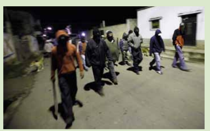
Carrying shotguns and machettes, a citizen security patrol walk the streets of 'Barcenas' in Guatemala City Sept. 5, 2007.

military type pistols and revolvers<sup>39</sup> worth $18.1 million according to declarations made by the 14 States declaring these exports.<sup>40</sup> However, Guatemala reported the total value as $26,6 million imported from 32 countries, according to Guatemala import declarations.<sup>41</sup> In the exporter declarations, the total amounted to an annual average of $1.8 million and in Guatemala's import declarations, there was an annual average of $2.7 million.